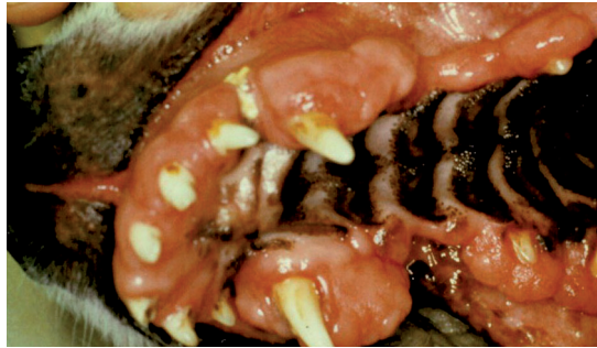
Multiple Epulis in a Canine Oral Cavity